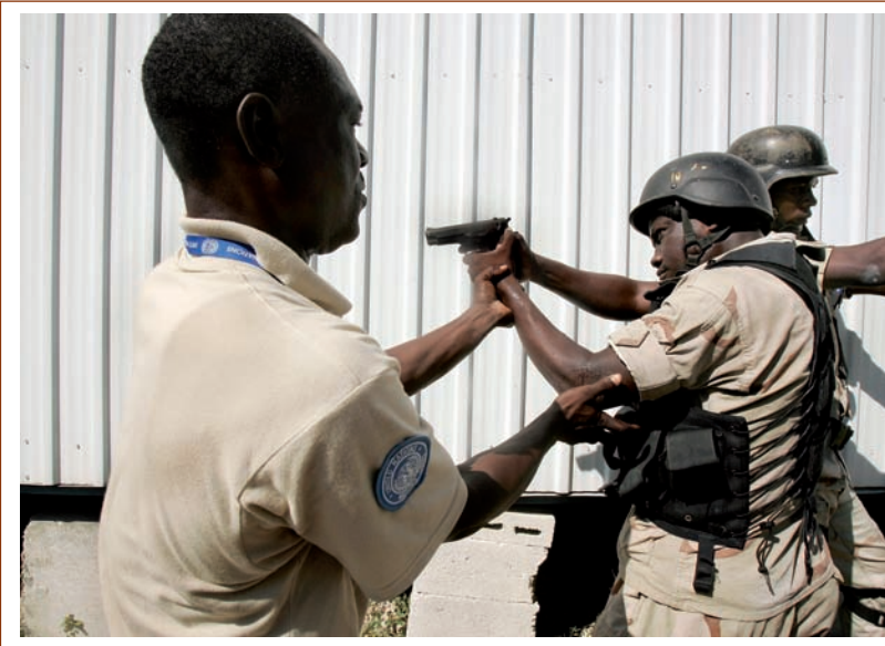
An officer of the United Nations Stabilization Mission in Haiti (MINUSTAH) civilian police giving instructions in firearms handling to a recruit; one of a class of 788 potential police men and women at the Police Academy in Frere being trained by 25 MINUSTAH civilian police, Port-Au-Prince, Haiti, 2 August 2005.

Acknowledging the challenges faced in post-conflict countries where local police forces are politicized or under the control of the military or simply made impotent – or, worse, through lack of funds and cor-