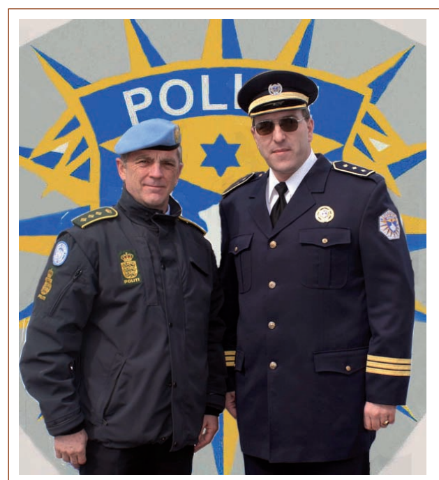
Commissioner Vittrup and KPS Colonel Selimi.

Mr. Hutchings stressed the extensive training that the UN police had provided to their Kosovo counterparts, noting in particular that almost 2,000 local officers had now been trained in the latest and most effective methods of riot control, while local minority police officers had been assigned to villages that had felt neglected by the force.