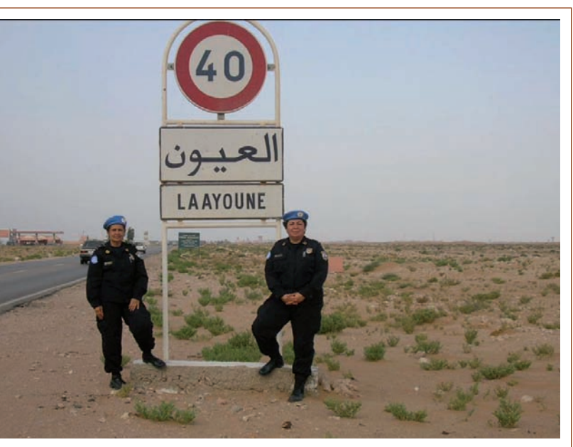
UN Police in Western Sahara.

female officers that were trained in Greece to serve in Timor-Leste.