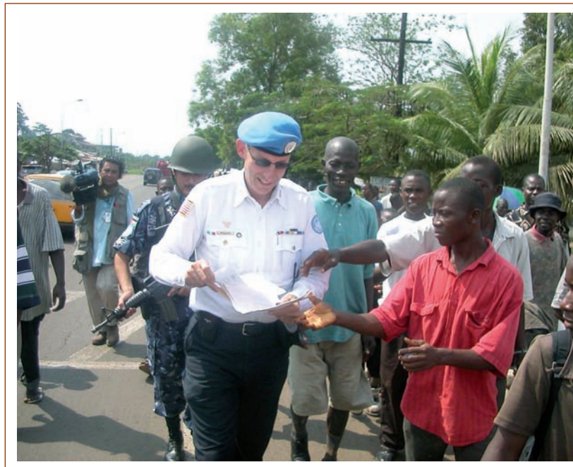
Mark Kroeker (left), Police Commissioner of UNMIL, hands out a message on crime prevention, Monrovia, Liberia, 5 December 2003.

In war-ravaged countries where those with guns are more likely to be thugs than officers, establishing the rule of law is essential to achieving sustainable peace, and police-support activities are central to