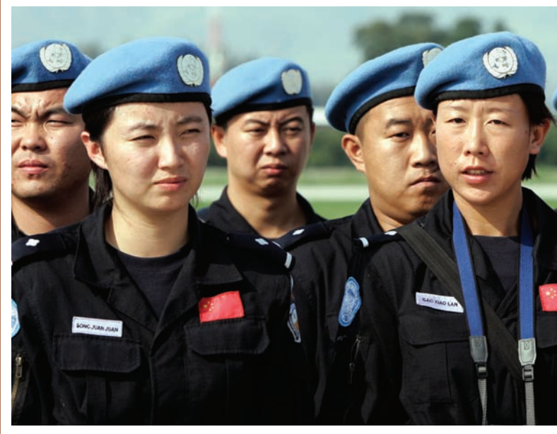
Members of the Chinese Formed Police Unit arrive in Port Au Prince, Haiti, 17 October 2004.

Greater representation of women is necessary to strengthen the implementation of mission mandates.